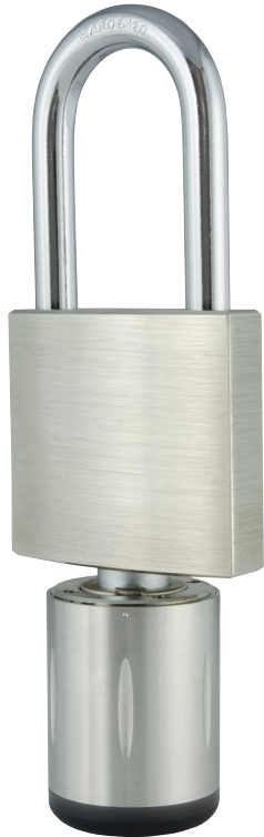
TRAC-Guard padlock with 2-inch shackle