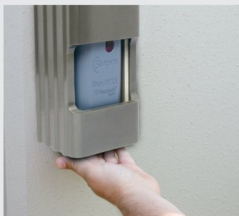
1. Turn on the Bluetooth.