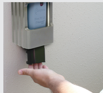
4. Obtain the key from the released key container.