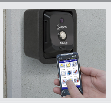
2. Tap Open Device.