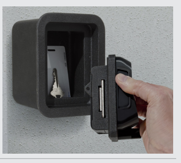
Open the vault when the green LED flashes.