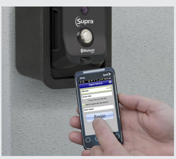
3. Enter the PIN code and Begin .