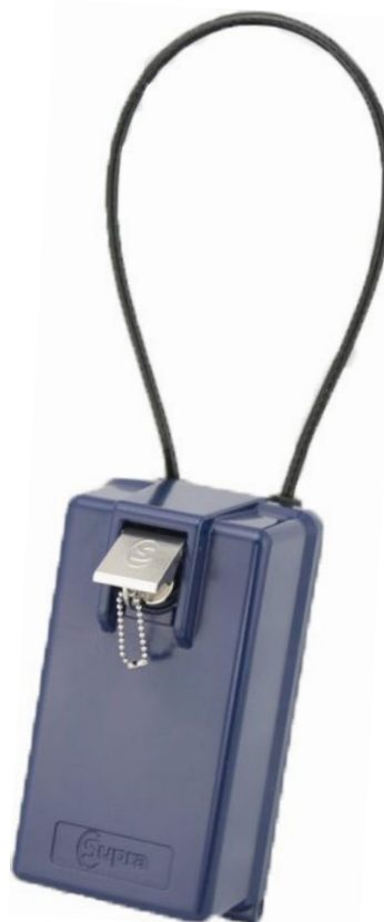
Indigo XL Portable Keybox