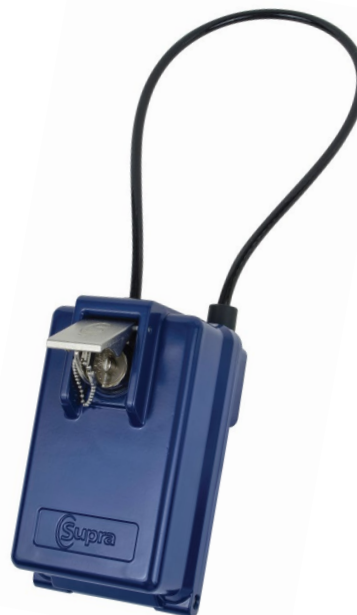
Indigo Portable Keybox

©2025 Honeywell International Inc. All Rights reserved. 0525