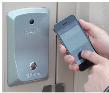
3. Enter the PIN-code.