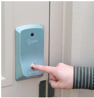
1. Turn on the Bluetooth.