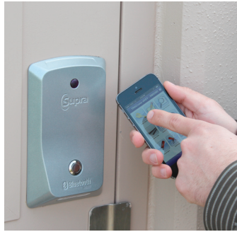
2. Select Open Device .