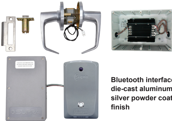
Bluetooth interface is die-cast aluminum in silver powder coating finish

TRACcess® intelligent locking device, alarm interface, and NEG 48 V power converter