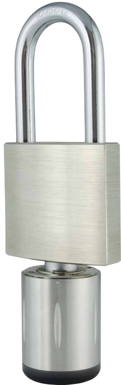
TRAC-Guard padlock with 2-inch shackle