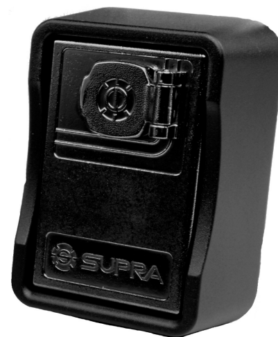
Industrial Magnum: P/N 001287 A permanent-mount version is available for those applications where window access is impractical.