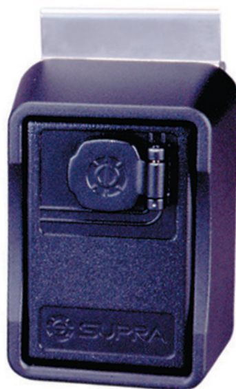
Supra Magnum: P/N 001288

© 2010 UTC Fire & Security. All rights reserved.