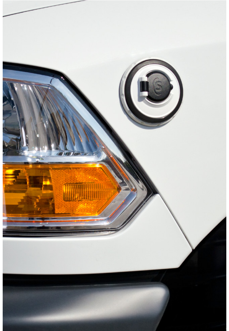
Elante Key Storage Tube