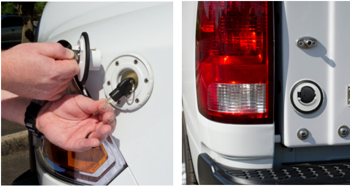
Permanently-mounted key storage tube keeps keys where you need them.

The Elante key storage tube is easily installed on all types of vehicles including vans, trucks, carriers, boom trucks and buses.